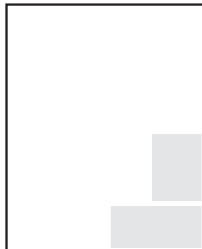
1/16 PAGE 2.4" X 4"