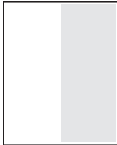
1/2 PAGE 5" X 16"

Original graphics, artwork and photographs submitted for scanning must be continuous tone images. Printed halftones and other second generation printed material cannot be accepted. Unless otherwise requested, materials submitted for scanning become the property of the Farmers Voice Hawaii.